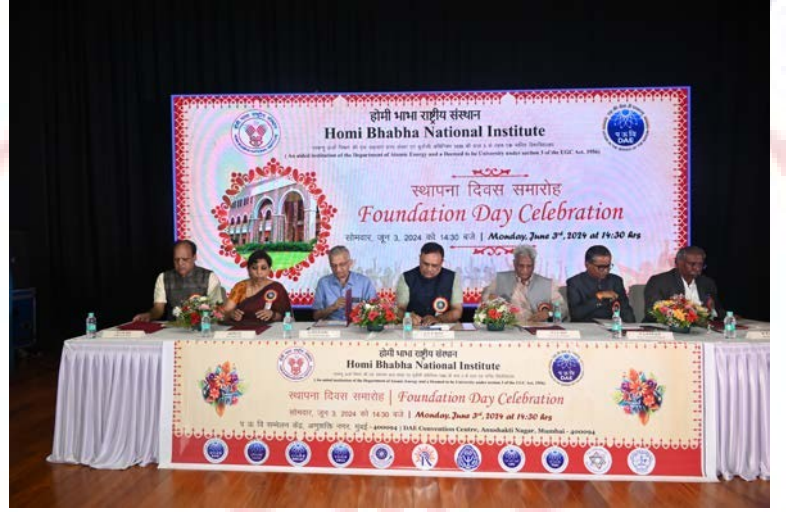
Dignitaries on the dais