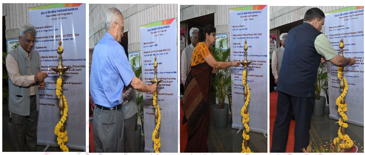
Lighting of the Lamp by the Dignitaries